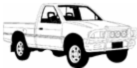
Pick Up Truck